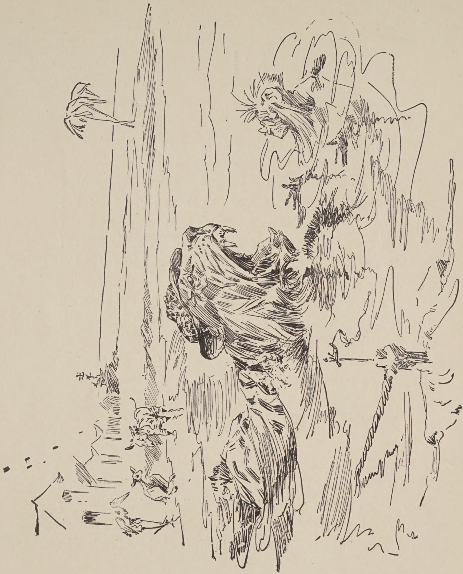
TIGER'S OPEN MOUTH SCARES LITTLE MONKEY.